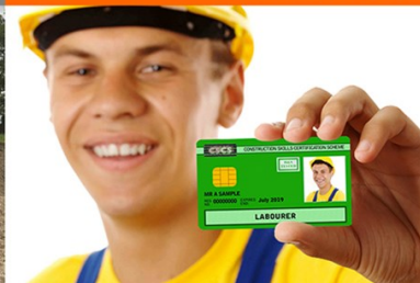
SITE SAFETY PLUS TRAINING