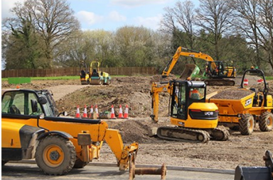
4 ACRE TRAINING FIELD