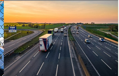
HIGHWAYS ENGLAND COURSES