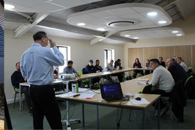
9 TRAINING ROOMS