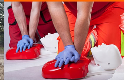
HEALTH & SAFETY COURSES