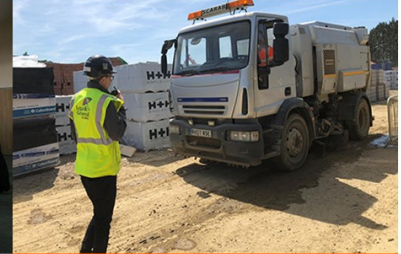
CISTC ON-SITE TRAINING